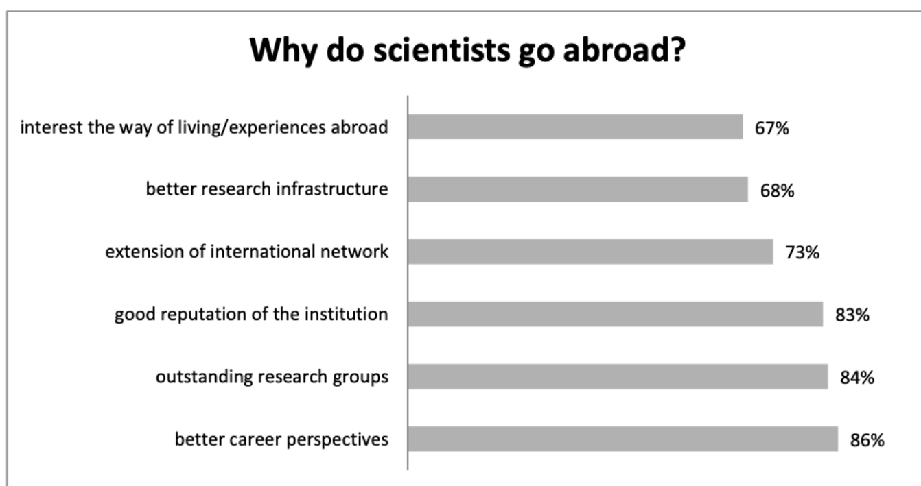
Figure 5: Reasons why scientists go abroad 2)

Figures 5 and 6, which show reasons and obstacles for international mobility, are for science in general, but the interview results used for this report agree with them. The general results are also reflected in literature and further studies. 1) As these are the most important reasons and obstacles to mobility of scientists it is possible to transfer these findings to the field of physics. Nevertheless, it must be noted that the field of physics is diverse and unique, and therefore has to be seen as a particular field of science.