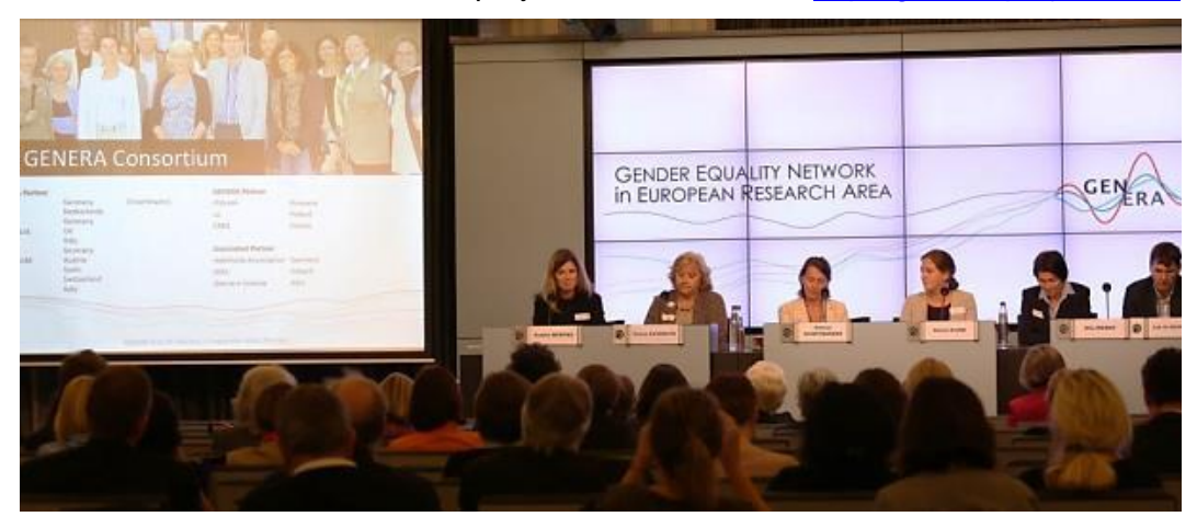
(GENERA kick-off meeting on September 17<sup>th</sup> 2015 in Brussels)

More information about the GENERA project can be found at <a href="http://genera-project.com/">http://genera-project.com/</a>