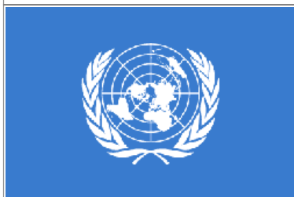
International Day of Women and Girls in Science

Interesting links to activities related to the International Day of Women and Girls in Science on February 11, 2020: