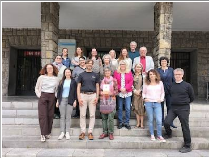
ERASMUS+ GENERA-COPA working meeting at University of Oviedo On April 20/21, 2026

Read the news on the GENERA-COPA website