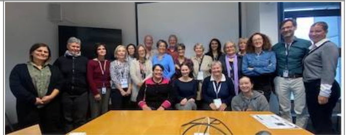
GENERA General Assembly 2024 at CERN On September 25/26, 2024