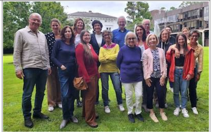
GENERA General Assembly 2025 and ERASMUS+ GENERA-COPA kick-off at University of Limerick On September 4/5, 2025

Read the news on the GENERA-COPA website